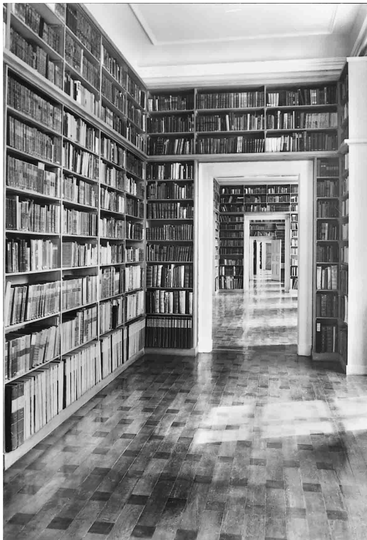
Upper Gallery of the Forschungsbibliothek Gotha.