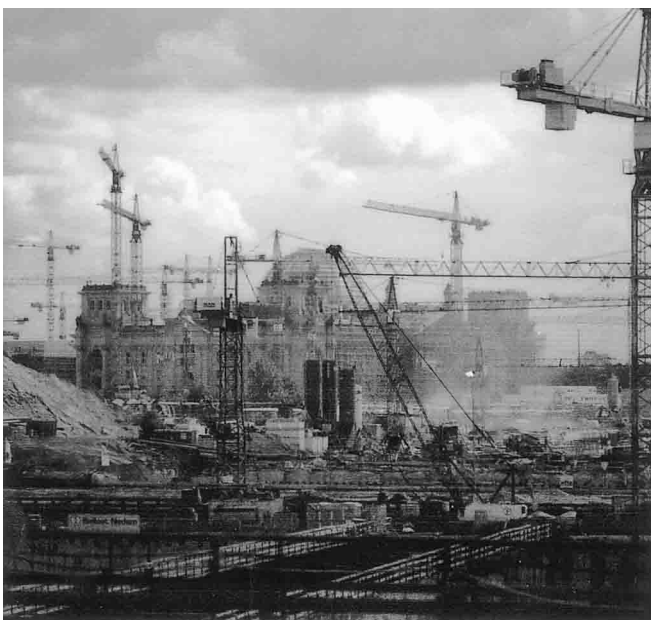
Gerhard Faller-Walzer, untitled.