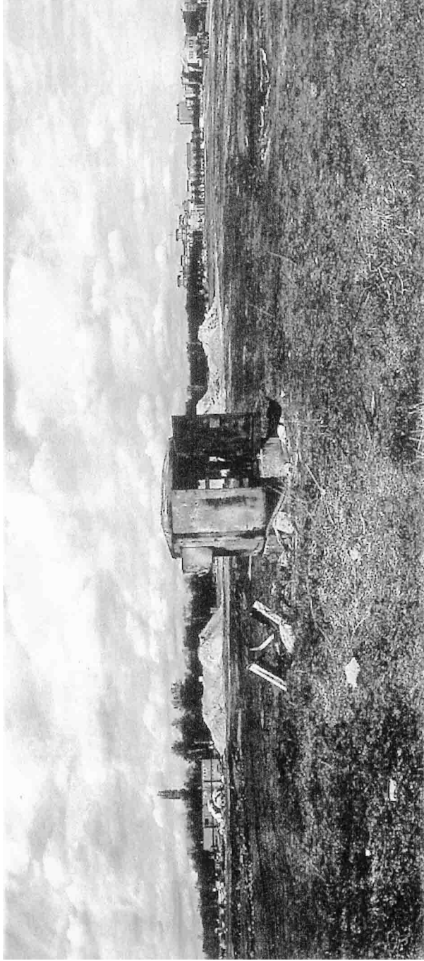
Gerhard Faller-Walzer, Potsdamer Platz, 6. April 1994.