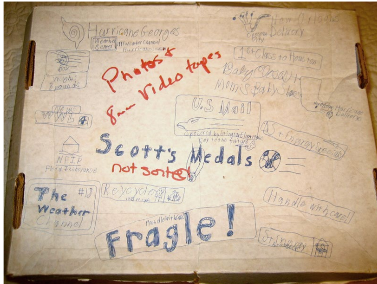
Box labelled by nine-year-old boy before the family evacuated for Hurricane Georges in 1998

Seventh Conference on Digital Humanities and Digital History at the German Historical Institute Washington, March 19 - 21, 2025, Washington, D.C.