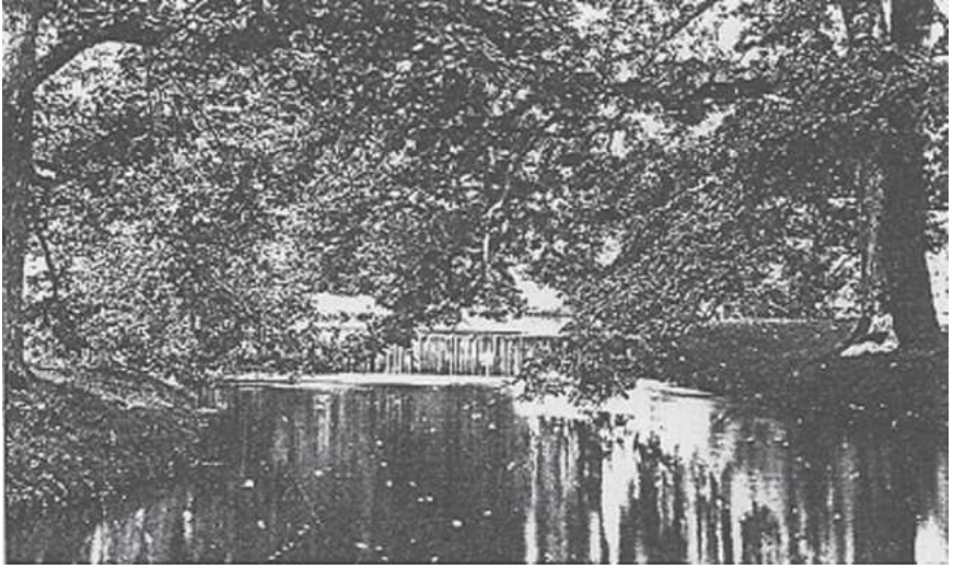
Figure 1: Stream in Oak-Wood Muskau: photograph and caption by Charles Eliot, 1886.