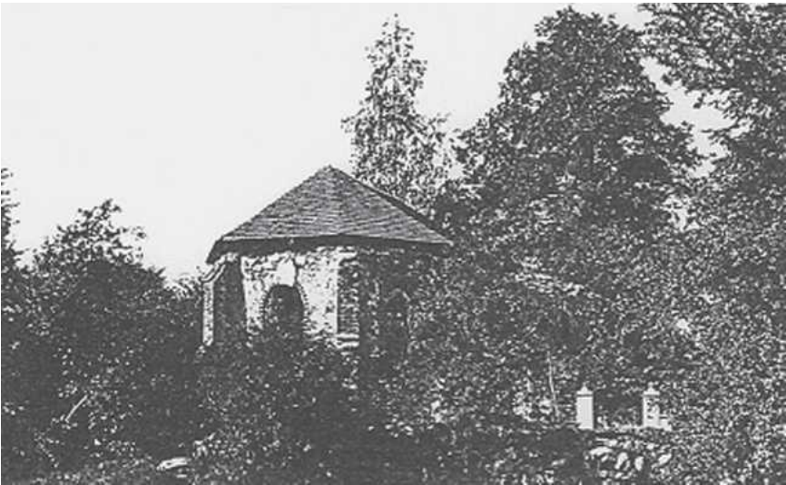
Figure 4: Ruins of Dorf Berg. Muskau: photograph and caption by Charles Eliot, 1886. Eliot Collection, Loeb Library, Harvard University.

to have been generally disappointed by Europe's public parks, he was clearly impressed by Muskau. He wrote: "The greater extent and larger features of river, lake and hilltop of Muskau give it an incontestable advantage over the smaller areas of the New York parks although we