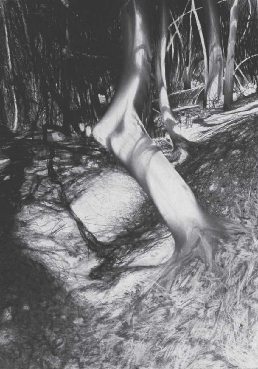
Elzbieta Sikorska, Diamond (2001)