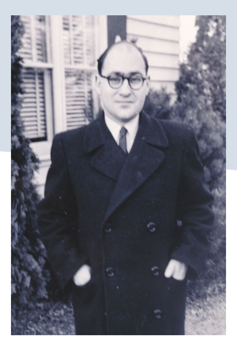
Figure 3. George L Mosse in Iowa City, around 1950

The power of colossal forces, to which so many historians have referred, often seems to leave out personal responsibility.<sup>36</sup>